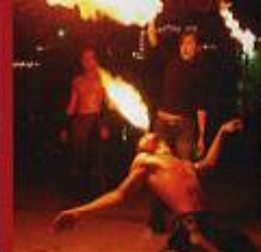
A'Famosa Cowboy Town