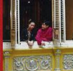
Baba and Nyonya Heritage Museum