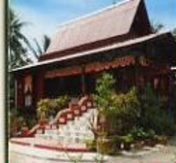
Traditional Melaka House