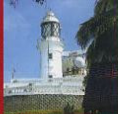
The Lighthouse at Tanjung Tuan