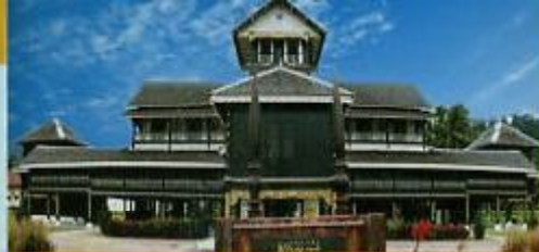
Sri Menanti Royal Museum