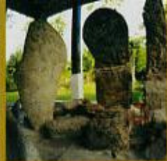
Pengkalan Kempas Historical Complex