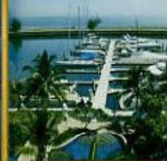
Admiral Marina & Leisure Club