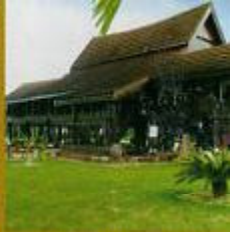
House of Pendita Za'ba